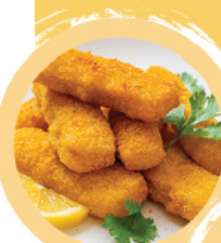
Battered Fish & Chips